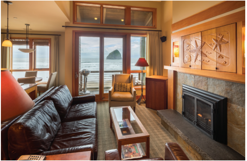
The living in room in one of Headlands' 18 oceanfront cottages.